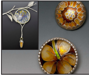
Linda Darty Enamels: Buttons, Badges and More

If you are intrigued by enamel work, here is your opportunity to learn from a renowned enamel artist and teacher. Add transparent, luminous color to your jewelry by creating small cloisonné or painted enamels on fine silver or copper. In this master's program, students will learn to shade enamels using a variety of techniques appropriate for cloisonné, champlevé, basse taille, or painting processes. Students will also focus on blending colors to achieve value gradations, luminosity, and depth. Topics covered will include fundamentals for applying and firing enamels, use of both lead and lead-free color, sifting, foils, cloisonné and painting techniques, torch and kiln firing, and creating matt or gloss finishes. Soldering and setting techniques will be discussed as they relate to enameling.