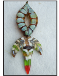
Sage Holland and Beau Anderson Beadfinity - intermediate to advanced soft glass

As glass beadmakers, we are challenged for original and empowered work; skills and techniques become an expanding language to compose beauty with substance. With the aid of a long list of specific skills and techniques, unlimited combinations will begin to present themselves. In the first two days, students will dive into the list of fine stringer work, custom cased stringers, a selection of layouts for surface manipulation designs, exotic color combinations with layering of transparent over intricate dot work, such as masking dots and rosettes, clear casing over detailed surfaces, plunging through layers, twisted canes of varied styles and meticulous application skills, the use of silver foil, gold leaf, and special reduction glass. This program will cover multiple bead beads, bent, roundels and disk shapes like hands, heads, triangles, paisleys, moons and suns, hollow beads, and highly patterned disks. Scissor and tweezers techniques, off-mandrel work with multiple tungsten perforations, along with murrini and multiple color ribbon canes, and finesse in feathering will also be covered. For the last day of class, students will combine juxtaposed patterned pieces facilitating infinite forms that set the student on the exciting path of uncharted territory.